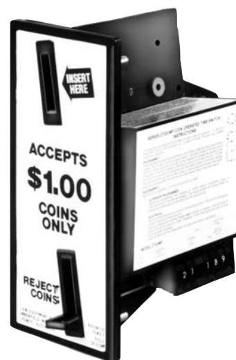
CT20-MF-FL with undersize coin return