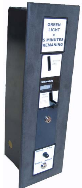
PMDEBP housing with a C22FL Token Operated Time Switch plus Key Bypass Switch and Light Intensity Switch