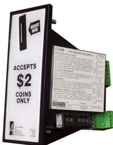
CT20-MF-FL without undersize coin return