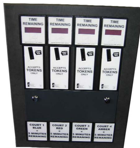
Special housing with 4 CT20MFFL Token Operated Time Switches