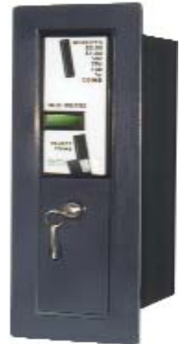
Model PM - 20/22 Series