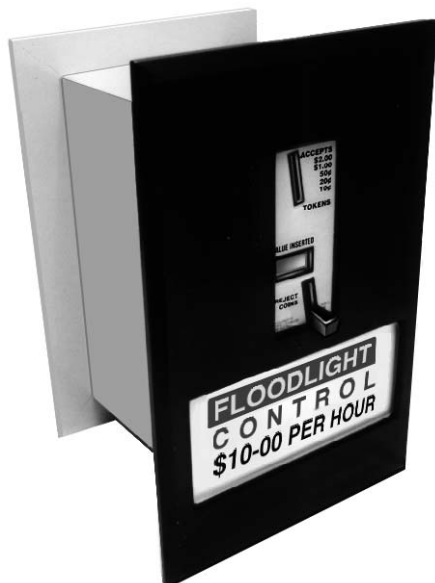
Model WM-RE with fascia