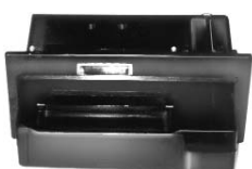
PD31 dispense tray