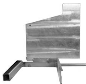
PD35 FC1L internal mechanism