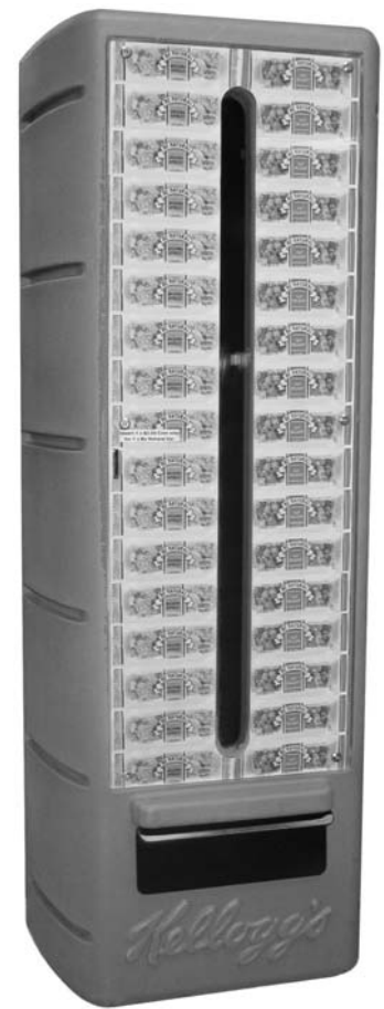
PD37 in special customer housing