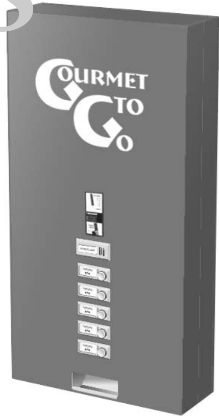
PVM4000 Typical cabinet