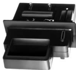
PD32 dispense tray