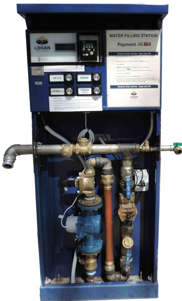
WD2500 with internal back-flow prevention